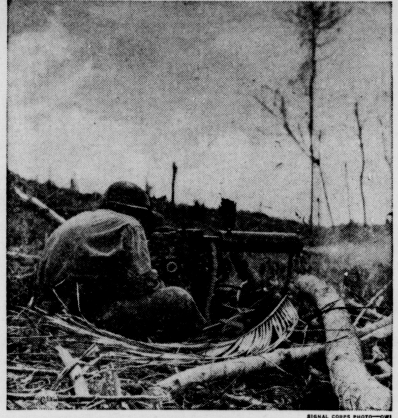
A Yank firing a .50-caliber machine gun on an enemy pocket on the right flank of the Japanese main line of resistance at Arawe, New Britain.