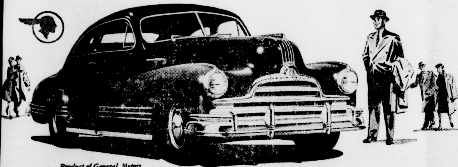
Product of General Motors