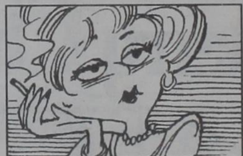
Actress Marlene Dietrich was born Maria Magdalene Dietrich in Berlin, Germany in 1904.

For farmers who have questions about how to use pesticides safely, and for anyone who wants information about how pesticides are used on cotton farms, there will be a new resource available January 1. That's the launch date for the Careful By Nature Web site, careful by nature.