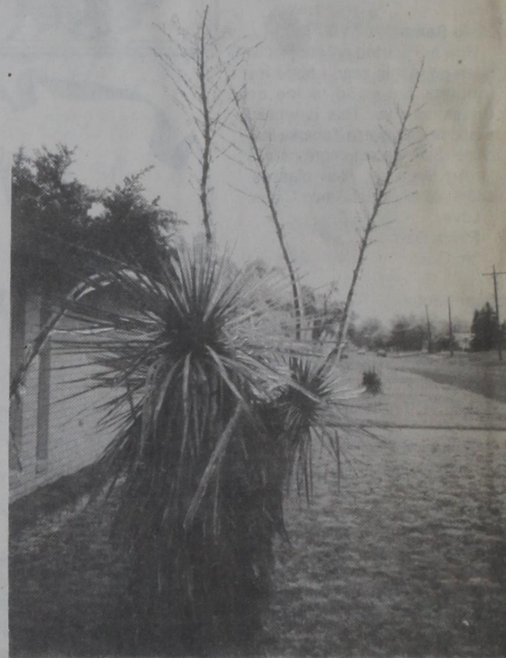
COATING OF ICE: The coating of ice received during the night Saturday caused quite a bit of damage to trees in Wheeler. An electrical outage was reported in Mobeeitic and Channel 6 was not on the cable in Wheeler. The picture above shows the ground covered with limbs in the back yard at 1104 S. Canadian.

THE WHEELER TIMES PAGE 10 — Thursday, December 24, 1997 "Wheeler, town of friendship and pride."