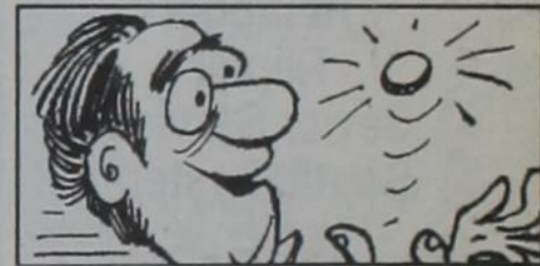
The word "dime" comes from the Latin word decimus meaning "tenth."