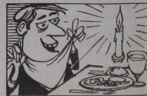
Aristology is the science or art of dining.

WHEREAS, Governor Bush has identified the issue of assisting counties in the effort to preserve these structures as a state priority.