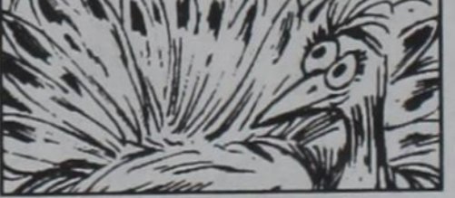
An adult peacock's train contains 150 feathers.