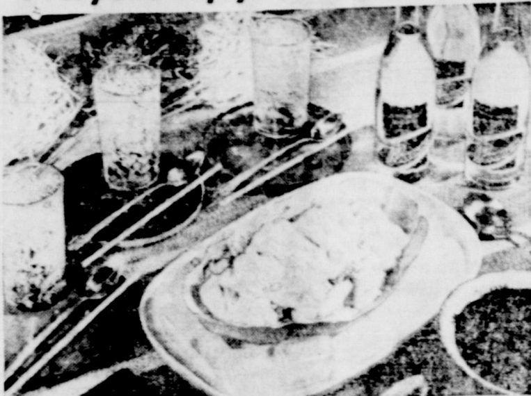
Chocolate Ice Cream Sodas are a perennial favorite. Made at home and served buffet style, they delight teen-agers, children and adults.

For a party or just for a re- fresher, everyone likes a choco- late ice cream soda. Teen-agers especially will delight in making them for their friends.