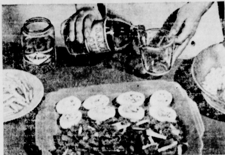
Hot Green Bean Salad, served with deviled eggs, is easy to prepare for luncheon or evening meal dishes.

A delicious entree for a chilly day is Hot Green Bean Salad. Prepare it in a jiffy for a luncheon dish, accompanied by deviled eggs. Serve with omelet, macaroni and cheese, or luncheon meat.