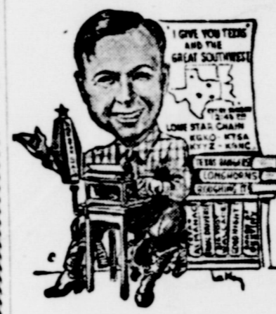
By BOYCE HOUSE

A diver here descends to inspect the Lake Pontchartrain crossing of United Gas Pipe Line Company's Lirette-Mobile pipe line. The 14-inch pipe, for approximately 25 miles, rests on the floor of the lake and recently was found to have been attacked at several points by barnacles. Protected by "somastic" (a coating composed mainly of asphalt and sand) the pipe was serving as an excellent anchorage for the small marine animals which for centuries have been a source of annoyance to seafarers. Chemical engineers of the company found that certain sections of the pipe which were covered with mud were relatively free of barnacles, indicating that submerging the entire line in mud might discourage any further attack by the crusta- ceans. The boat shown above is a part of the United Gas marine equipment which operates in the marshes, canals and lakes in the company's New Orleans district.