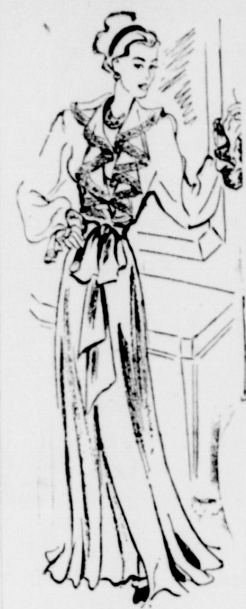
Negligee with matching gown.