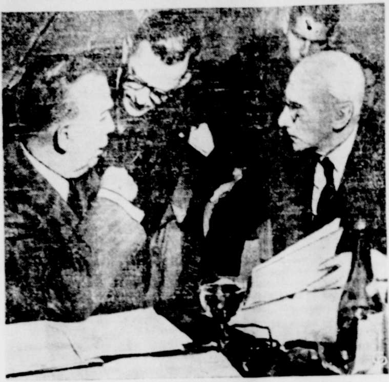
U. S. SECRETARY OF STATE George C. Marshall is shown conferring with Raul Fernandes (right), Brazil's Foreign Minister, at a session of the Inter-American Conference in Petropolis, Brazil. In center is William Pawley, United States Ambassador to Brazil.