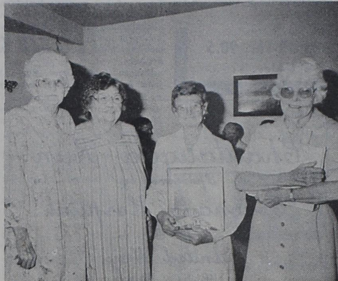
THE WINNERS: The monthly domino tournament was held at Wheeler Care Center Tuesday. There was a five

This summer a type of matting was placed around the baby pool. The placement of this matting was made possible by donations received over the years by the local people. Alpha