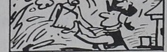
The first fire fighting organization in America was started in Philadelphia.