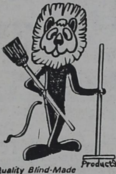
Quality Blind-Made Products