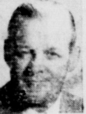
C. W. Harder, Texas Congressman, is seen here.

Marshall Plan gives Norway $130 million to combat inflationary pressures resulting from the excessive amount of money pumped into the nation's economy during the war. In other countries American taxpayers' dollars have been given to fight deflation.