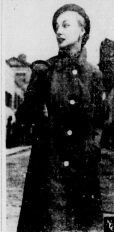
This smart, tailored cotton raincoat is a two-in-one fashion, reversing to become a coat of a different color. The cotton fabric is Zelan treated to give protection from rain and snow, the National Cotton Council reports.

Most girls marry a struggling young man, struggling to stay single.