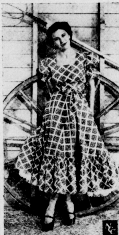
Cyd Cyrisse, graceful MGM dancing star, takes a "busman's holiday" and enjoys square dancing in her off-hours. Charming Cyd swings her partner in an old-fashioned cotton print frock reminiscent of the type her grandmother wore. She wears a ruffled cotton petticoat with a hoop to make her skirt whirl when she promenades.

Maybe it isn't a disgrace to be poor, but it's mighty inconvenient.