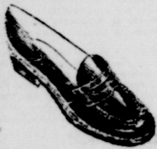
GIRLS PENNEY TYPE