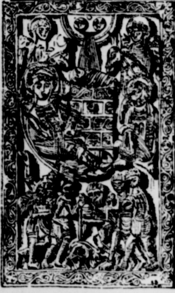
Wooden panel of the Ironsides of Abo Sarge representing the Nativity.

Although most Americans consider Rome as the seat of early Christianity, an equally ancient branch of Christendom—the Coptic Church—was established during the first three centuries of the Christian era in the city of Alexandria, Egypt.