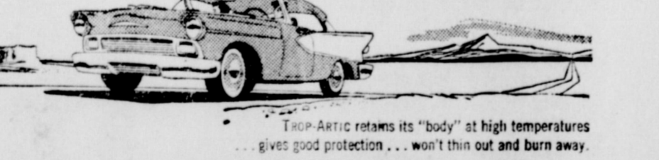
Trop-Artic retains its "body" at high temperatures... gives good protection... won't thin out and burn away.

Change to Trop-Artic Motor Oil for All-Weather Lubri-tection