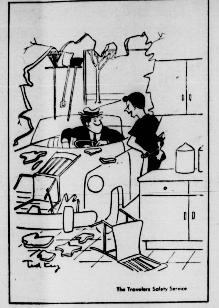
"Tied one on again?"

The wolf from door I can't repel Still I must help keep Burma well):