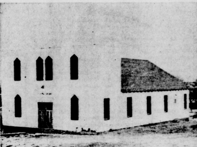
Wheeler Assembly Of God