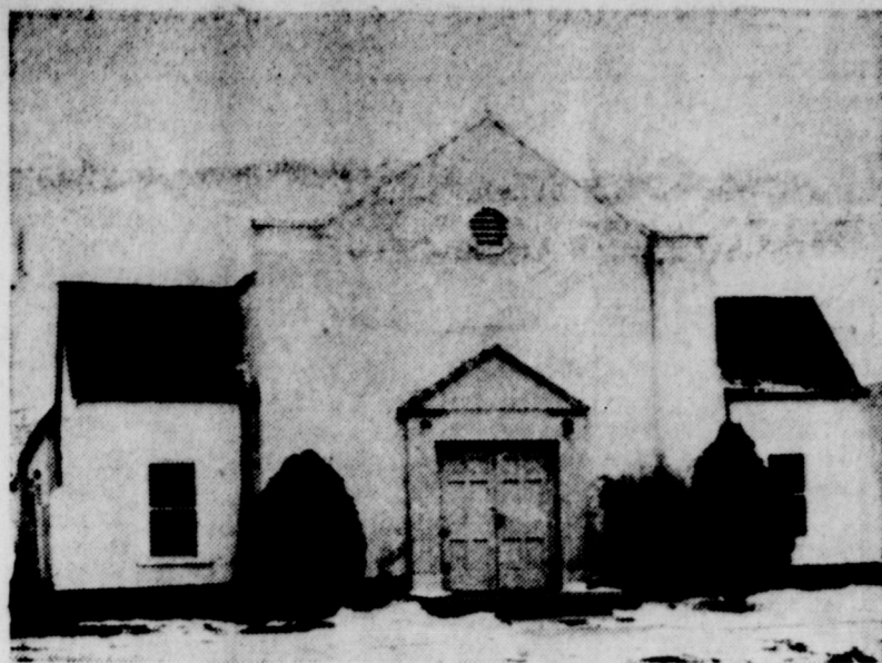
Wheeler Church Of Christ