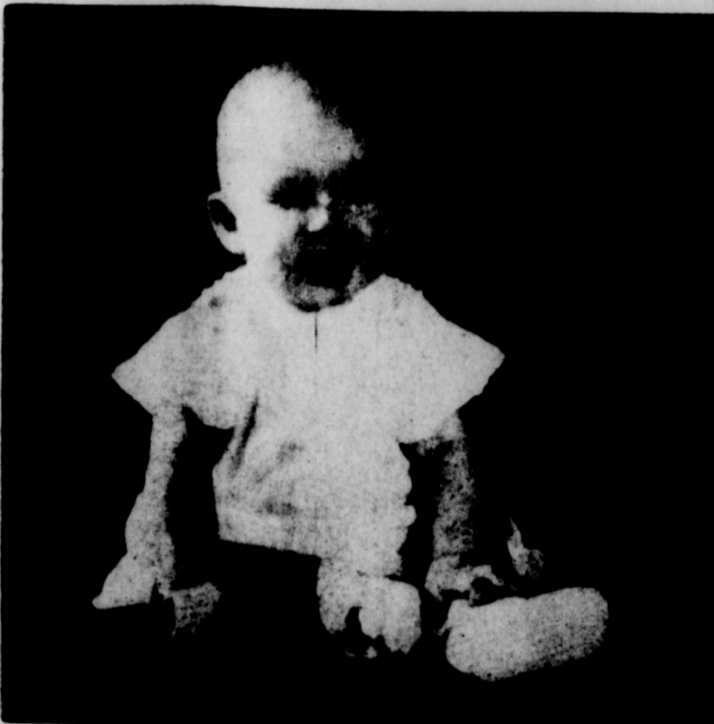
What's Your Guess?