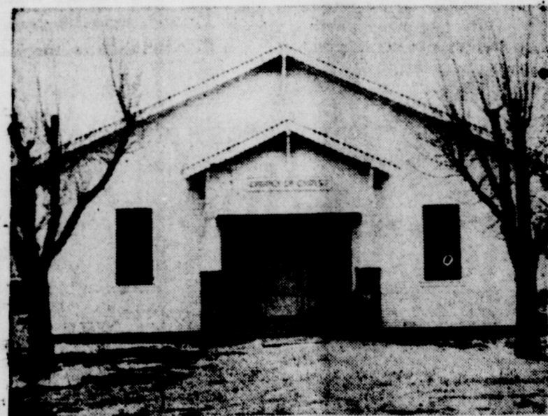
Mobeetie Church Of Christ