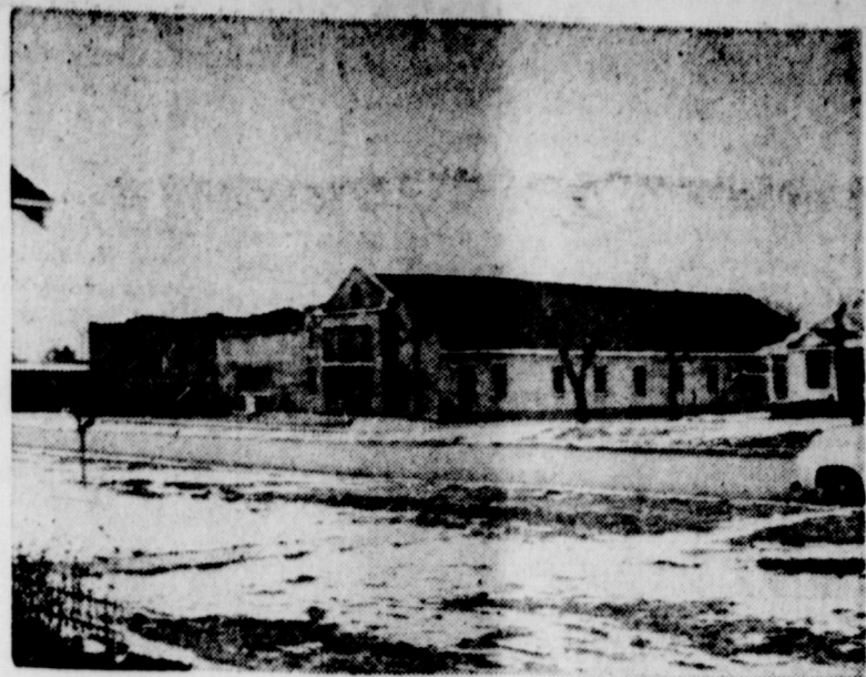
Wheeler First Baptist Church