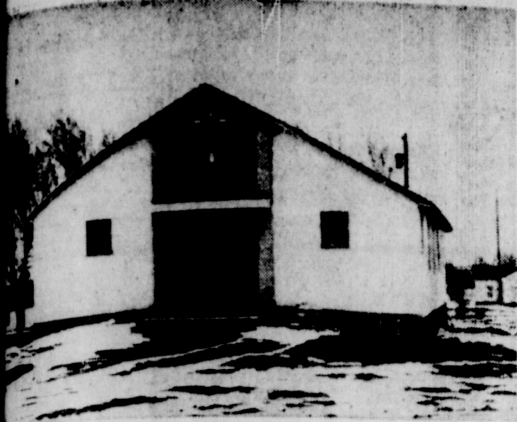
Wheeler Nazarene Church