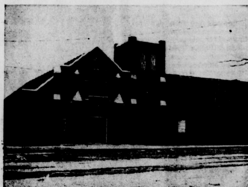
Wheeler First Methodist Church