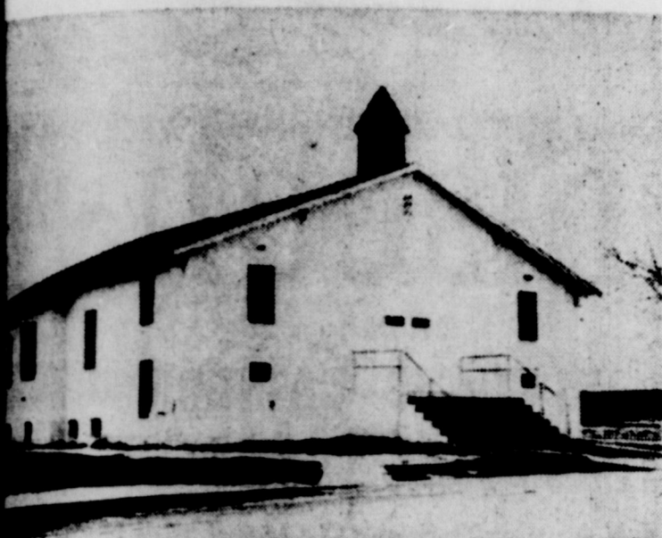
Mobeetie First Baptist Church