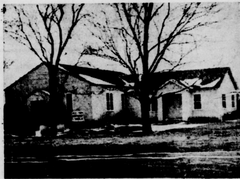
Kelton Methodist Church