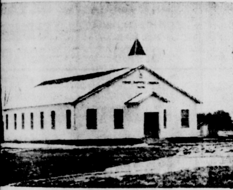
Kelton First Baptist Church