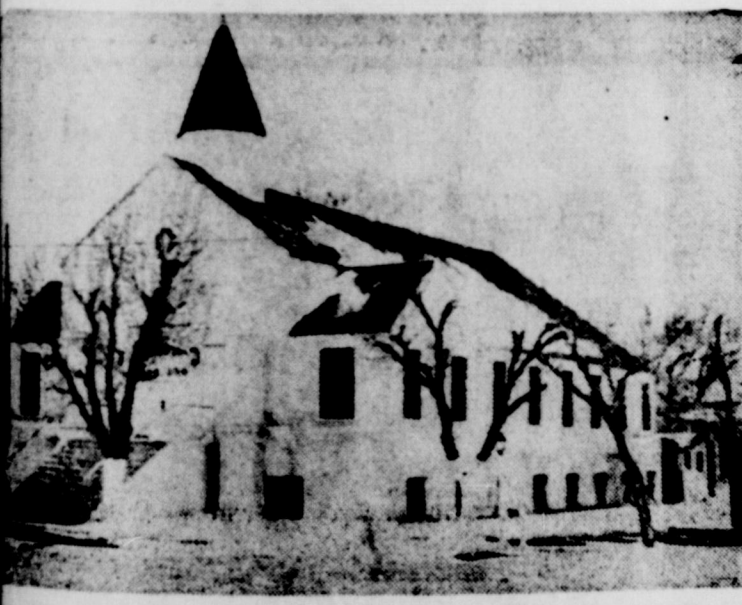
Mobeetie First Methodist Church