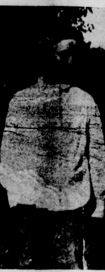
What Is Your Guess?