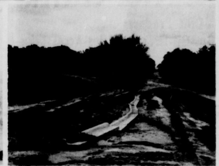
CURB AND GUTTER LOST: 400' of curb and gutter on the 600 block of Seventh Street was washed out by the heavy rain Sunday night. Several yards of loose dirt were used in filling in the street. The curb and gutter had been run, but none of the base for the paving had been applied at the time the heavy rain came.