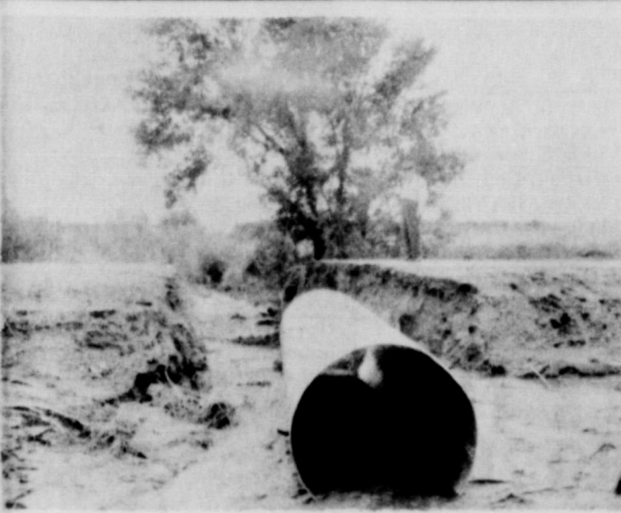
36" TINHORN: Commissioner Pendleton looks at the damage to the county road north of the airport. The tinhorn in the picture is 36" in diameter. Labor and equipment to repair the damage is estimated at $400. Good conservation upstream might have prevented the damage to many county roads.