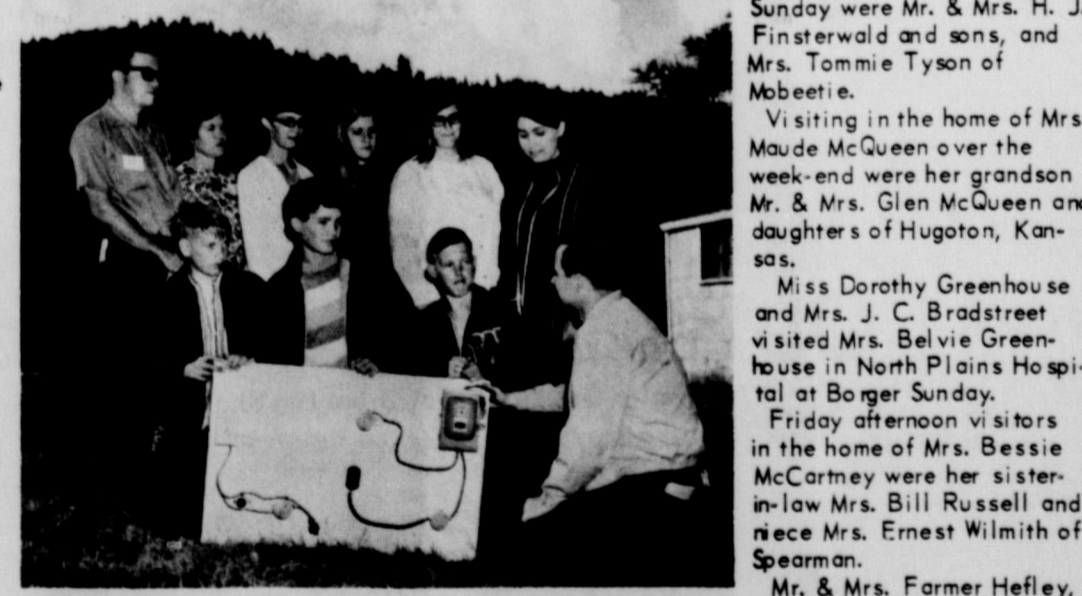
SPECIAL FROM CLOUDCROFT, NEW MEXICO: Six Wheeler County 4-H members, two adult leaders and an extension agent spent a week in the Sacramento Mountains of New Mexico at a 4-H Electric Camp sponsored by the Southwestern Public Service Company.

The Wheeler boys will meet Mobeetie for a ball game Tuesday, July 28 at the Wheeler Kiwanis Ball Park. The game will begin at 8:00 p.m.