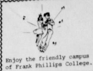
Enjoy the friendly campus of Frank Phillips College.