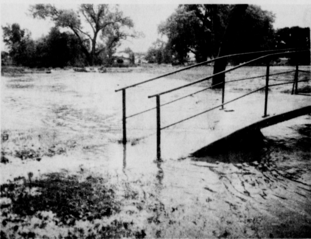
A LOT OF WATER: The foot bridge across the creek at the City Park was surrounded with water Thursday evening. The flood waters covered the bigger part of the park.