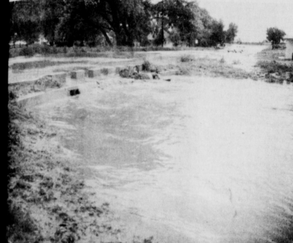
ON SEVENTH ST.: The bridge at the park was covered by the flood which resulted from the Thursday evening rain. The water was 6-7 feet deep a short time after the rain stopped. In the background is the 500 block of East Seventh which was heavily damaged by the water.