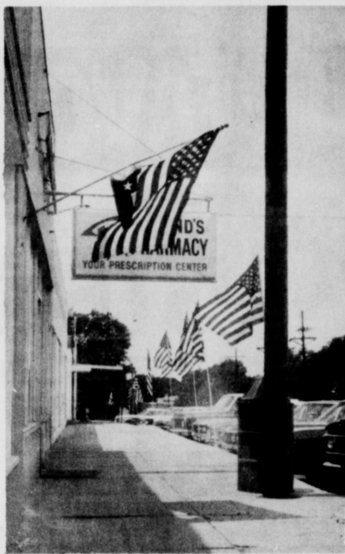
SEVENTY-SIX FLAGS: The Wheeler Kiwanis club placed 76 flags on the streets of Wheeler Monday, June 14-Flag Day. The flags were put out at 7 a.m. and removed at 6 p.m. "Old Glory" will be flown 10 days during the year. The service of furnishing, displaying and removing the flags is available for $10 per year; if you are interested in having a flag in front of your home or business, contact a member of the Kiwanis Club.