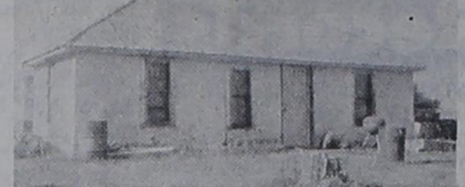
Remodeled 1 bedroom home with trailer space. Let the rent help make your payment.