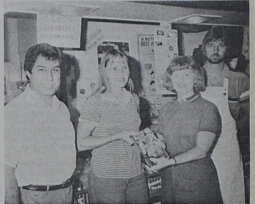
TOP 'O TEXAS CATTLEWOMEN GIVE AWAY COOKBOOK

The younger contestants will have a calf scramble each night. For more information, please contact our office at 806-826-5243.