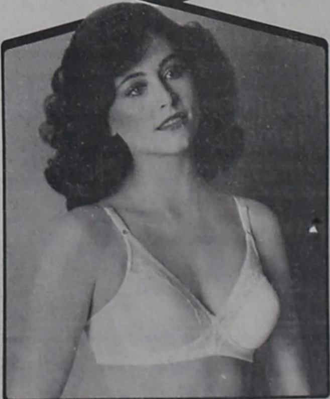
You'll hate to get dressed!

Sleek new bras from Playtex: Cross Your Heart