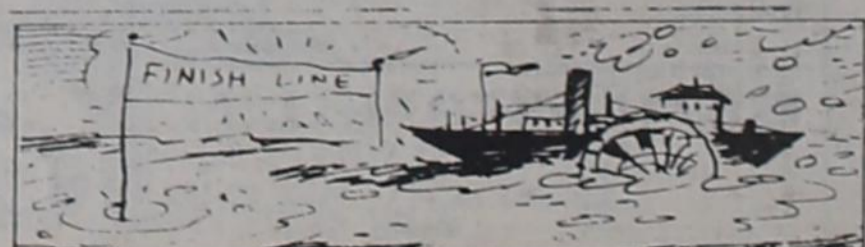
Steamboat racing was a popular sport in the mid-19th century U.S.

Please be generous with your contributions so more research and care for these children can be made available.