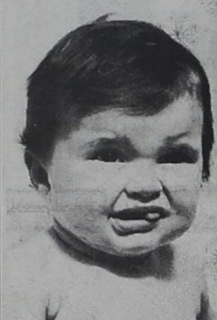
"Looks like a tornado."

There is no defense against violent windstorm damage. The cost of rebuilding has doubled in 10 years. Check with the RIVES Insurance Agency to be sure your windstorm insurance is adequate.