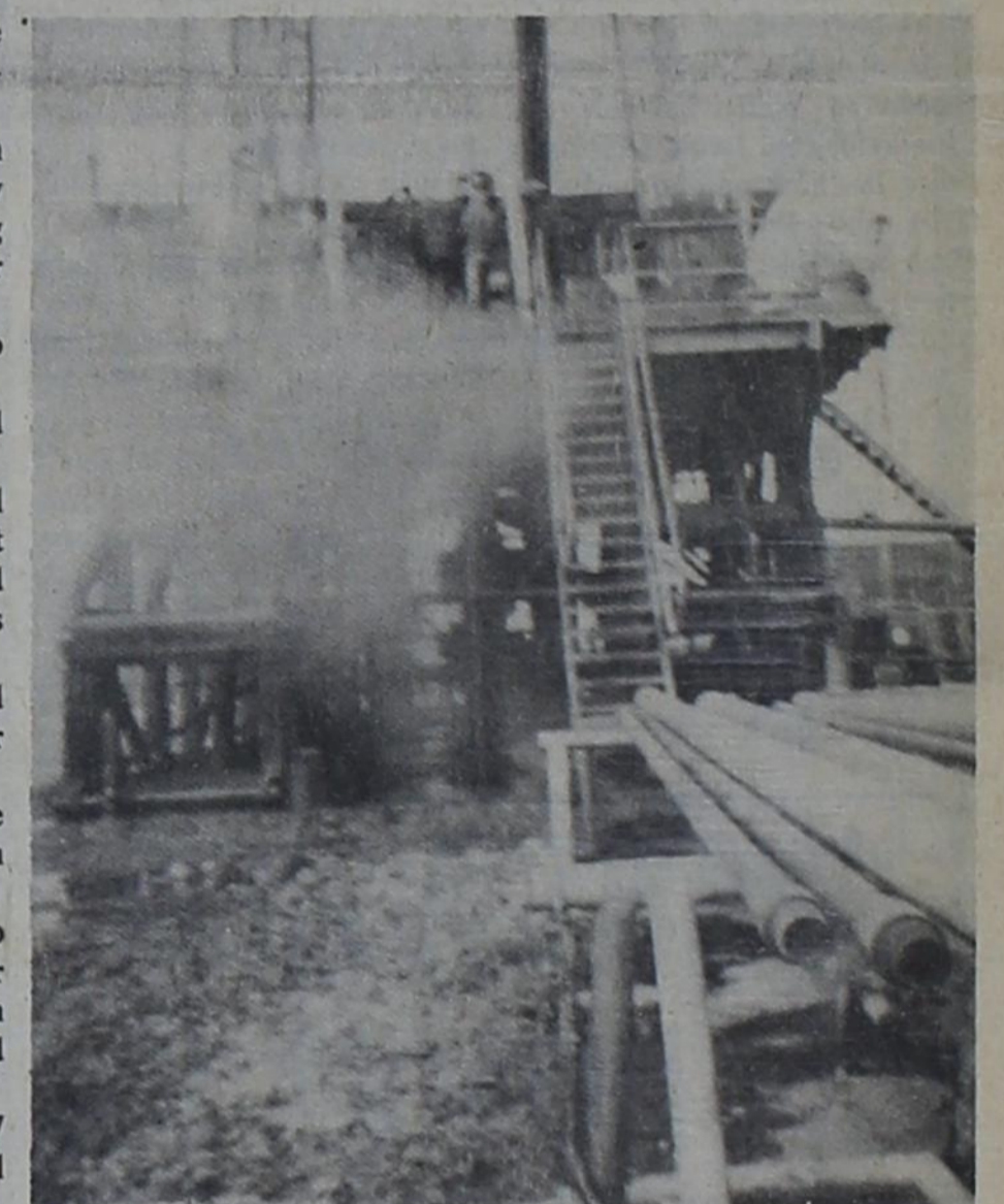
ESCAPING GAS: The Atherton well north of Wheeler is shown here as it looked when Red Adair arrived to begin work. The gas appears as a fog to the left of the picture.