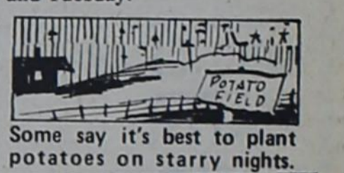
Some say it's best to plant potatoes on starry nights.