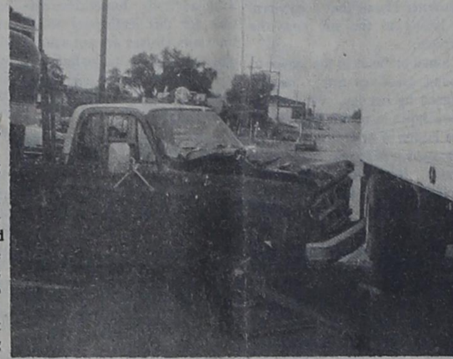
NO INJURY—NO DRIVER: This pickup was heavily damaged Sunday evening when it rolled under a truck approaching the stop light on highway 83. The pickup was parked at the Wilmart when the brakes failed.

Block met with local citizens at the County Courthouse during afternoon. He noted that Senator Bentsen began the Travelling Office project to learn from Texas citizens which federal programs and regulations are of particular concern.