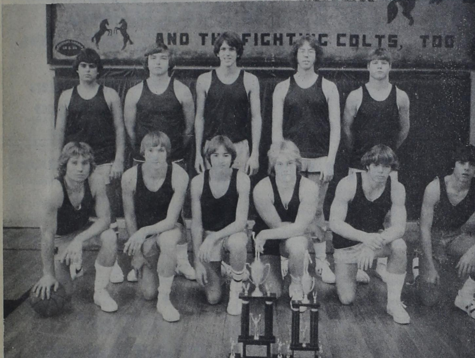
TWO TROPHIES: The Wheeler boys entered the Canadian Basketball Tournament Thursday, Friday and Saturday and defeated Shamrock, Eollett and Canadian to win top honors in the tournament. The boys were also presented the sportsmanship trophy. Named to the All-Tour-