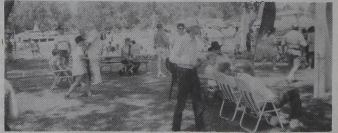
SOME OF THE CROWD: The people at the park found shade to sit back and enjoy the food, fellowship and entertainment all day Tuesday.

Educational programs conducted by the Texas Agricultural Extension Service serve people of all ages regardless of socioeconomic level, race, color, sex, religion, handicap or national origin.