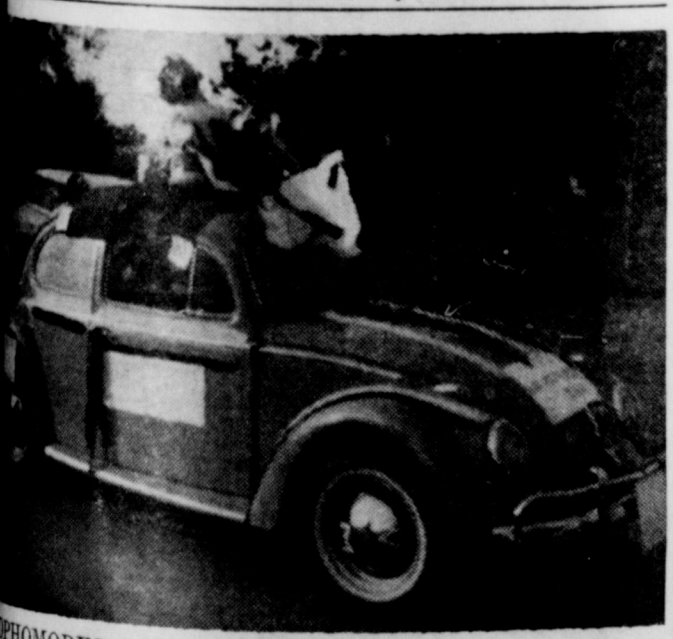
HOMORES WIN CAR PARADE: Top honors in the larade during homecoming activities last weekend to the Sophomore Class of Wheeler High School.