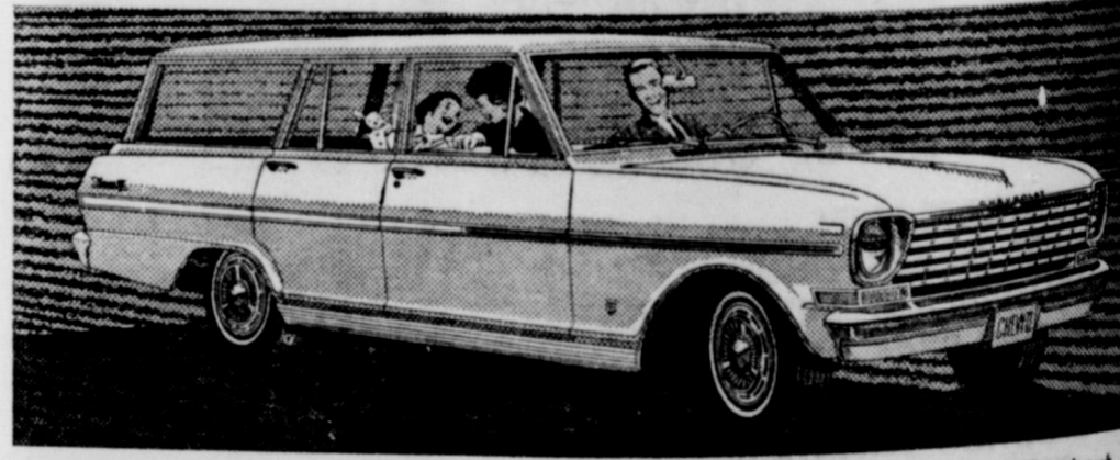
'63 CHEVY II NOVA 400 STATION WAGON—Gives modest budgets lots to brag about.