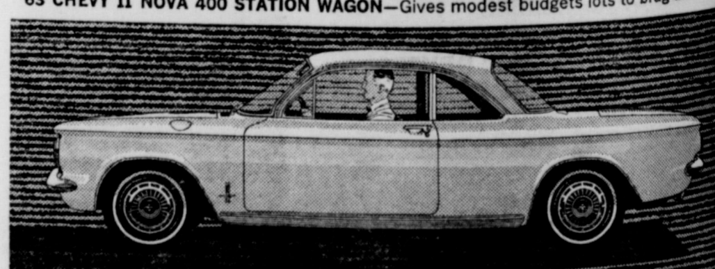
'63 CORVAIR MONZA CLUB COUPE—Lets your whole family get into the sports-car act. Ask about "Go with the Greats," a special record album of top artists and hits and see four entirely different kinds of cars of care and corvette different kinds of cars at your Chevrolet dealer's—'63 Chevrolet, Chevy II, Corvair and Corvette