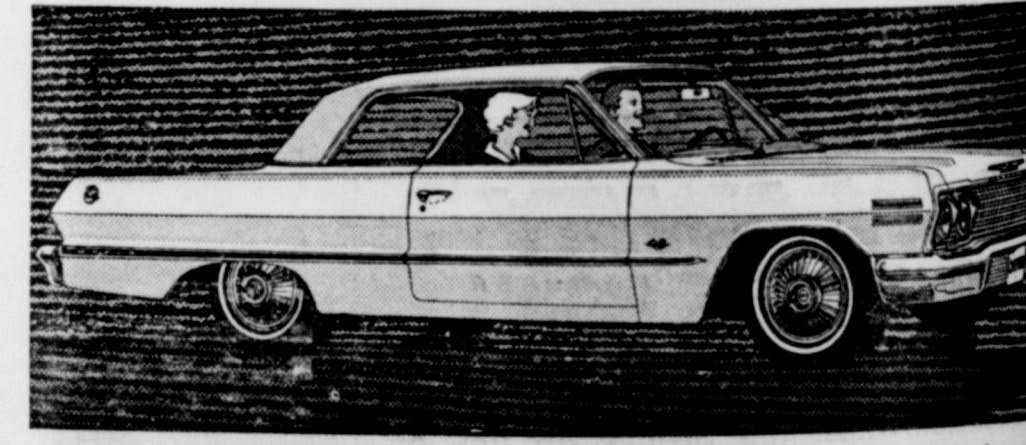
63 CHEVROLET IMPALA SPORT COUPE—Looks expensive? Look twice at the price.