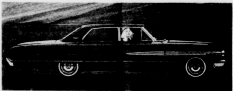
NEW SUPER TORQUE FORD—THE SOUTHWEST'S IDEAL VACATION CAR. Ford has more road-hugging heft for a smoother ride, more insulation against heat, and longer intervals between scheduled service than any other car in its class! Enjoy Ford's total performance this summer!

2 big reasons why the Big Switch is to Ford: