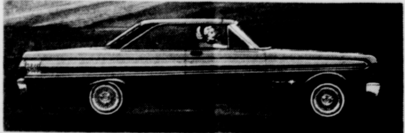
NEW FASTBACK FALCON—SPORTY REASON FOR SWITCHING TO FORD. Check a Falcon Sprint Hardtop for big value in the compact field. Great performance record—Sprint Hardtops took two class wins in this year's Monte Carlo Rallye. Standard equipment includes a 164-hp V-8, bucket seats, full carpeting. All-new styling.

COOL, COOL AIR CONDITIONING AT LOW, LOW COST With our record-high sales volume, we're offering record-high trading allowances. Now you can easily afford Ford air conditioning. (A great investment!)