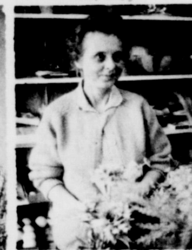
Jolly Hobby Shop