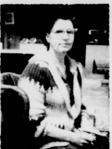
Iona Herd Trading Post