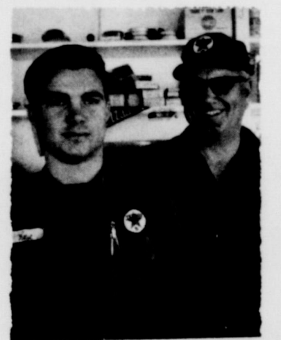
Owen's Service Station