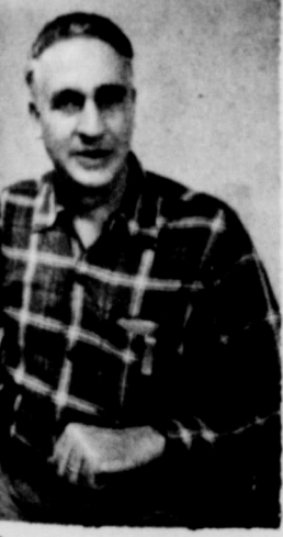
rainger McIlhany hany' Dry Goods