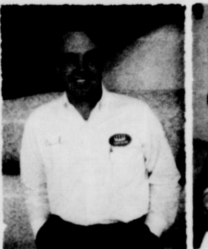
Cecil Pierce Lee Hardware & Furniture