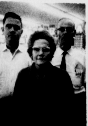
The Densons Clay Food Store