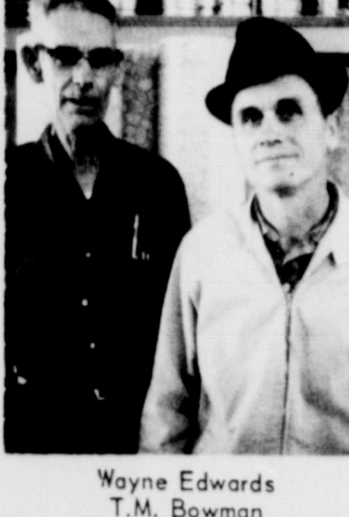
T.M. Bowman Wheeler Lumber Co.