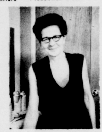
Norma-Velda Norma's Beauty Salon