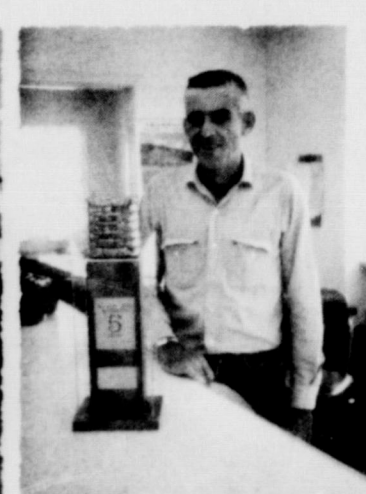
Fat Jones Wheeler Gin