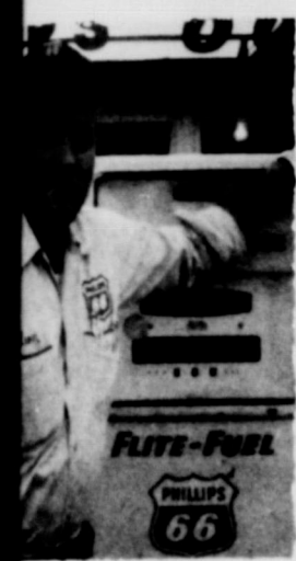
Leon Moore n's 66 Truck Stop