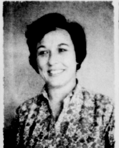
Hall's Flower Shop