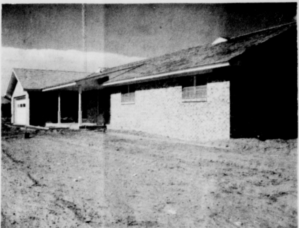
ON CANADIAN STREET: Mr. and Mrs. Harold Loyd Lee and family are completing the remodeling of their eleven room home. The 2700 square foot house features four bedrooms, 2 1/2 baths, family room, music room, living room, kitchen, utility. An open beam ceiling carries through the music room, family room and kitchen. The fireplace in the family room is complete with char-grill. In addition to being carpeted, the house has an intercom system. The kitchen cabinets are oak as well as paneling used in the house. The home has a two car garage and basement.

OUR TOWN IS CONSTANTLY ON THE MOVE AND IMPROVING