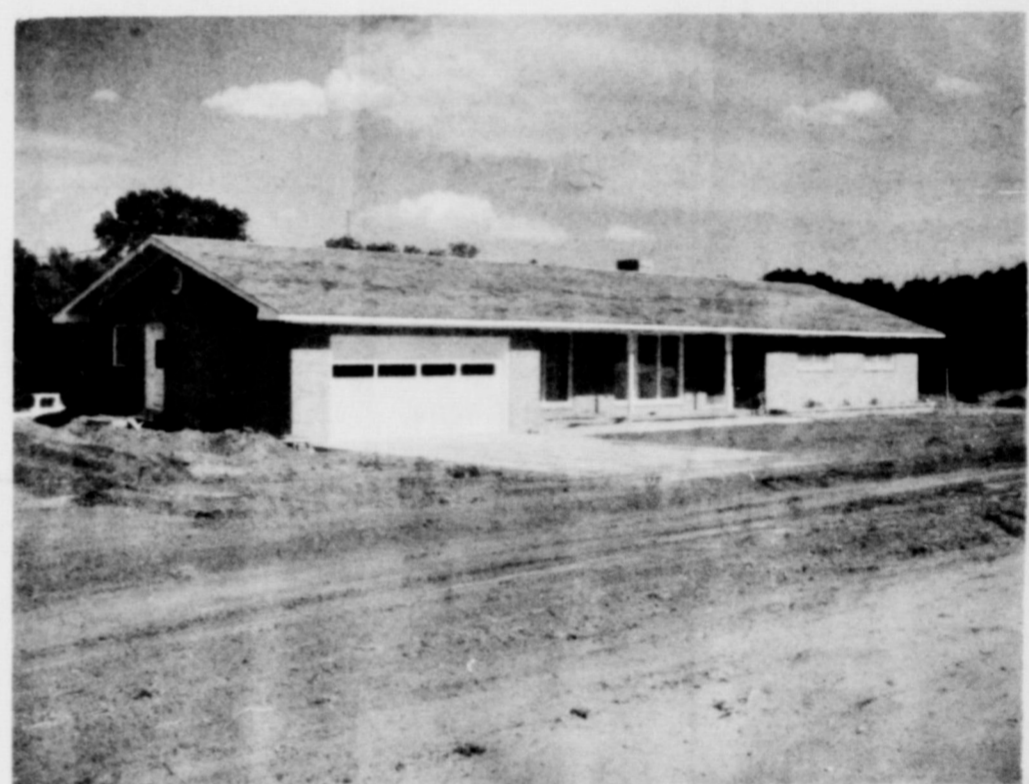
THE PIERCE HOME: Mr. and Mrs. Cecil Pierce, Miranda and Kristi reside in this three bedroom home on Red River Street. The brick veneer home has 2,068 square feet of living space. It is centrally heated and air conditioned with gas. The family room features a fireplace which can be seen from the total electric kitchen. The livingroom and dining room are separate. Breakfast can be served in a small breakfast room overlooking the backyard. Completing the home are a two car garage, utility room and three bathrooms.