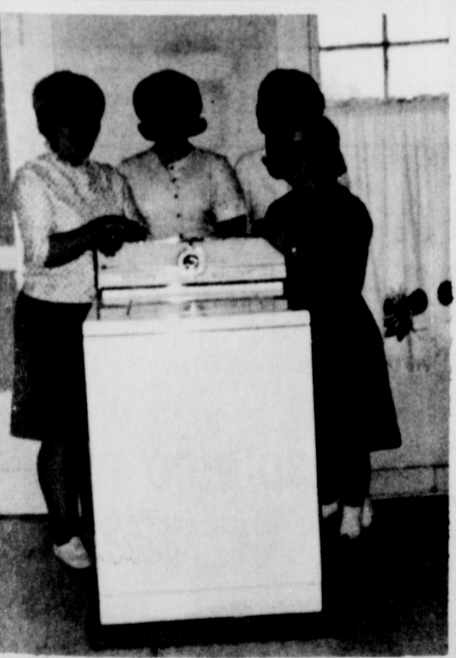
STAMPS HELP TEACH LAUNDRY TECHNIQUES: "Learn by doing" is the motto of the Wheeler public school homemaking department. And the girls are doing just that--using a new automatic washer recently obtained with Gold Bond stamps.

Results of Monday's Games Intermediate: boys team no. 1 6 and team no. 2 - 5; Senior boys: Team no. 2 - 19 and Team no. 1 - 6.