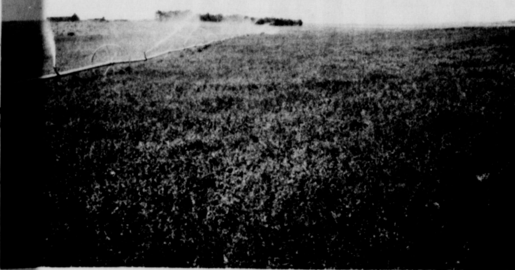
Irrigation is becoming more and more important to the economy of Wheeler Co. This picture shows a correctly designed sprinkler system delivering water to an alfalfa field near Wheeler. SCS technicians in Wheeler can assist you with the design of an irrigation system that will help you obtain maximum benefits from your irrigation water.