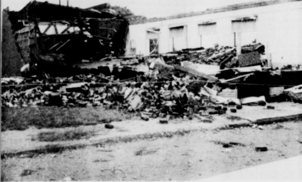
FIRST STATE BANK OF MOBEETIE: This is how the Mobeetie Bank Building looked Tuesday morning after it was hit at 9:25 p.m. by a twister which also inflicted heavy damage on several other buildings in New Mobeetie. It appeared the east wall collapsed and the roof dropped in. The bank's records and money were safely locked underneath the rubble. The two "walk-in" vaults are located at the back of the bank.

Rains up to 7" in the Mobeetie area were reported. Joe Rogers, local weather reporter gave 2.75" of rain for the week.