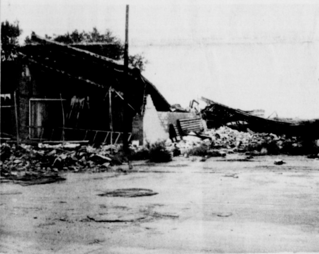
THE LEE BUILDING: Loyd Lee used this building to store farm equipment in. Underneath the debris are two trucks, a row-binder, a broadcast binder and an insilage cutter. After some digging Tuesday, the Lees were able to remove the truck closest to the rear of the building, but the remainder of the equipment remains in the building.