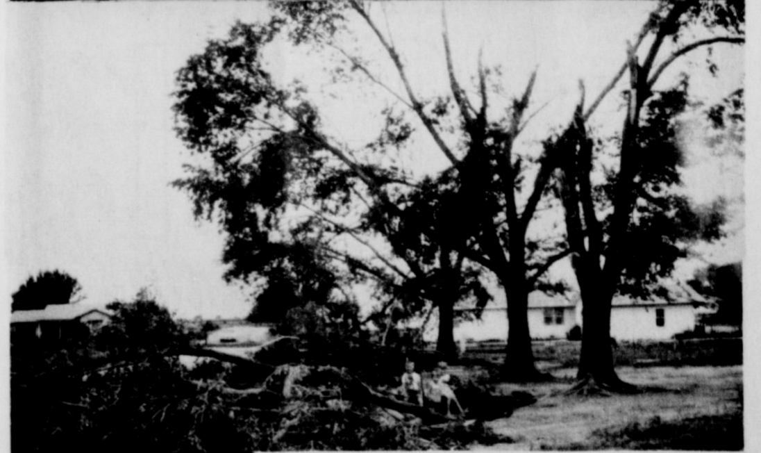
WHEELER DAMAGE: Mr. and Mrs. Bennie Ritchie returned home Tuesday, July 4 to find their trailer home overturned and much of its contents soaked. The trailer is located in the west part of Wheeler. The carport at the H. B. Guynes home was blown over their home and piled on the cellar where they had taken shelter from the storm which tipped their neighbor's trailer over. The pile of aluminum can be seen behind the tree. A vacant house two miles north and 1/2 east of Wheeler was unroofed sometime Monday night. The roof of the house is at the left (east side of the house) of the picture and is leaned on the windmill which was bent over by the storm. The front porch was ripped from the house and layed south of the main roof. Tree damage was heavy all over the city limits. Shown in the bottom picture is what is left of three trees at the home of Mrs. A. E. Connell corner of sixth and Commanche.