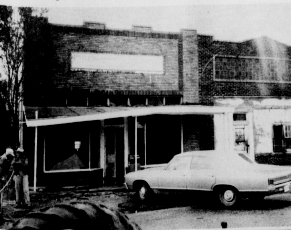
POST OFFICE: The Mobeetie post office, located 1/2 block east of the Bank, received only minor damage in Monday night's storm. Water stood an inch deep over the entire floor of the post office. None of the mail was lost in the storm.