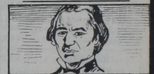
Andrew Johnson was the only ex-President to be elected to the United States Senate.

* Provide low-realism toys and objects that require children to use their imaginations. A big box, for example, can be a house, a rocket ship or a bear's cave, depending on the imagination of the child playing it.