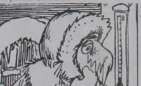
The coldest day ever recorded in an inhabited area was -90°F, July, 1983, in Vostok Station, Antarctica.

Take time to pray—it is the greatest power on earth.