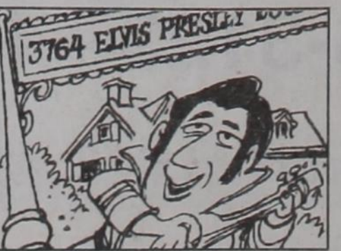
Elvis Presley's home, Graceland mansion, is located at 3764 Elvis Presley Boulevard, in Memphis, Tennessee.

To file a complaint of discrimination, write USDA, Director, Office of Civil Rights, Room 326 W, Whitten Building, 14th and Independence Avenue, SW, Washington, DC 20250-9410, or call (202) 720-5964 (voice & TDD). USDA is an equal opportunity provider and employer.