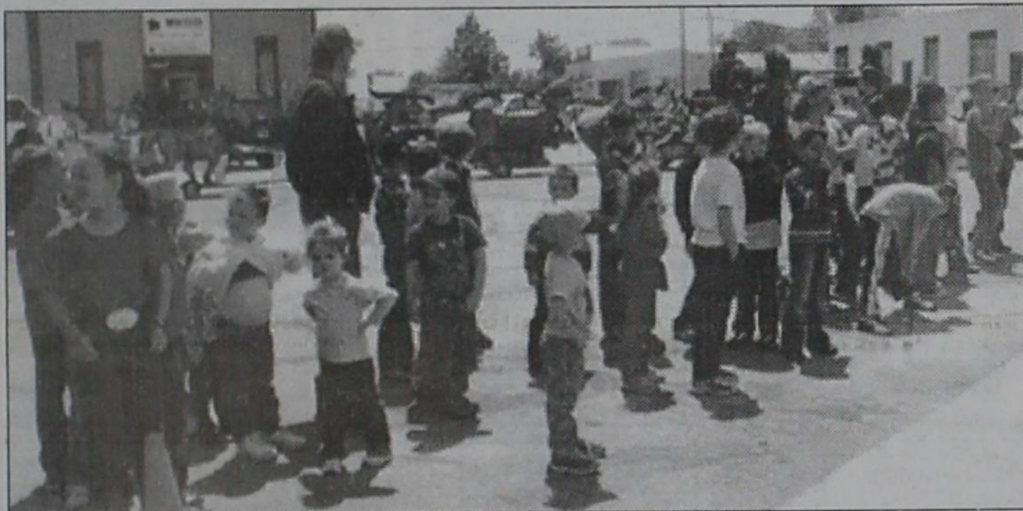
LINED UP AND READY: This group of young people are lined up and ready to participate in the WRCA Junior Ranch Rodeo held in Wheeler Saturday, May 1. Seven teams in three age groups participated. The rodeo was held at the intersection of Main and Texas Streets.