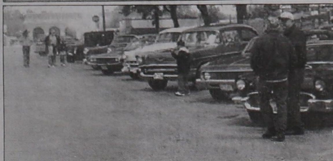
CAR SHOW: Twenty-two cars were lined up for viewing in the Eighth Annual Car Show, held Saturday in Wheeler in connection with the City-Wide Garage Sale.