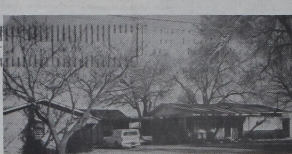
#74 Immaculate two-three bedroom, 1-3/4 bath frame home with two apartments 805 S. Main