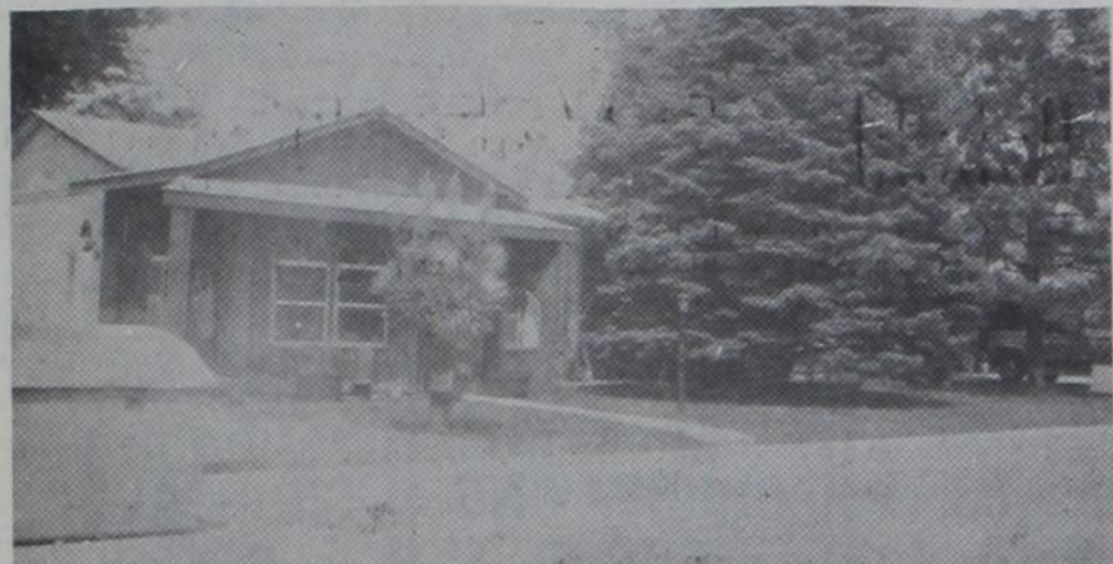
#58 Large four bedroom, two bath home with two fireplaces, large lot, double garage 512 S. Reynolds