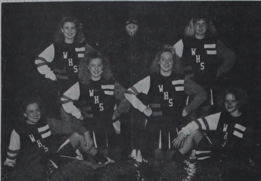
1990-1991 WHEELER HIGH SCHOOL CHEERLEADERS: This