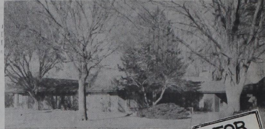
#75 Extra large three bedroom, 2-3/4 bath brick home on large lot with lots of storage 605 S. Stanley