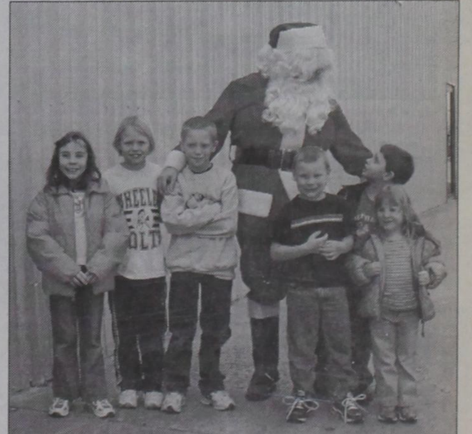
SANTA GREETERS: Santa was a little late arriving at the Wheeler Chamber of Commerce Christmas Open House on Sunday afternoon, November 28, 2004. He was greeted by these enthusiastic youngsters. Santa parked his reindeer and sleigh at the Wheeler Vol. Fire Dept. and rode to the square on the fire truck.