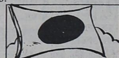
Tokyo became the capital of Japan in the early 1600s.