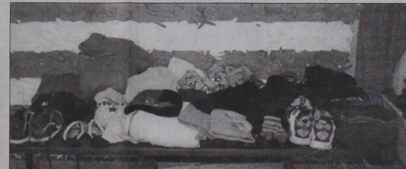
LOST AND FOUND: Shown here are items found or turned in at Wheeler School, football field and basketball gym. There are nice coats, sweatshirts, shoes, shorts, hats, etc. Please come by the school to claim your child's lost items.