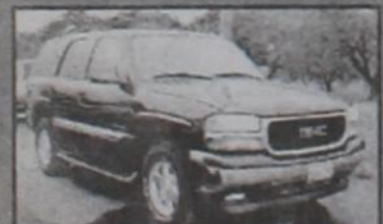
2005 GMC Yukon