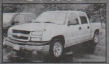
2005 Chevrolet 1500 Silverado Crew Cab