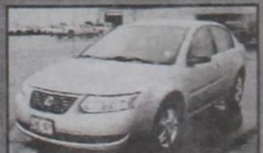
2007 Saturn ION Level 2