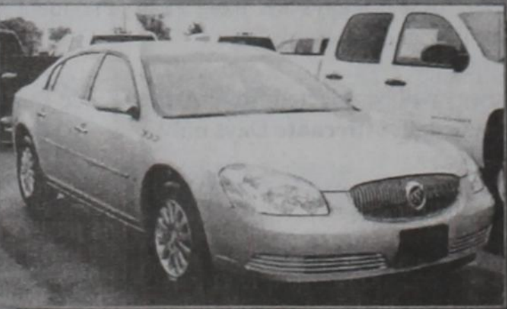
2007 Buick Lucerne CX