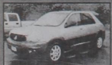
2005 Buick Rendezvous