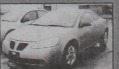
2007 Pontiac G6 GT