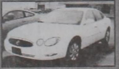
2007 Buick Lacrosse CX