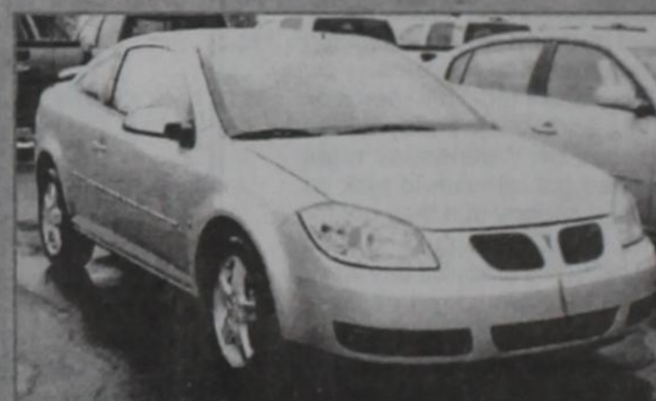
2007 Pontiac G5