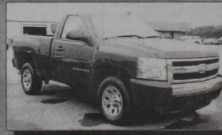
2007 Chevrolet Silverado C1500