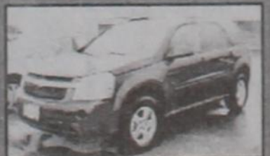
2007 Chevrolet Equinox LT