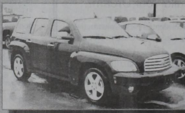
2007 Chevrolet HHR LT