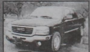
2005 GMC 1500 Sierra Crew Cab