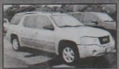
2004 GMC Envoy XUV