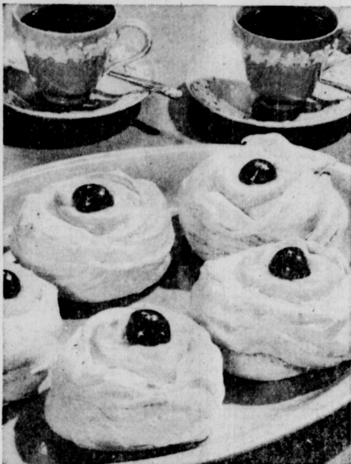
Light and delicious, cherry angel tarts are ideal dessert treats for balmy summer and early autumn days.

One-quarter cup chopped maraschino cherries, drained (about 10 cherries), 1/2 cups drained, canned, crushed pineapple, 2 tablespoons pineapple juice, 1 teaspoon lemon juice, 1/2 teaspoon grated lemon rind, 1/4 cup chopped filberts, 1/4 cup sugar, dash salt, 1 recipe plain pastry. Combine cherries, pineapple,