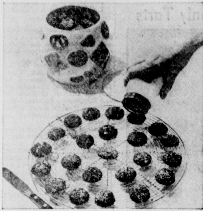
By BETTY BARCLAY

It's a mighty comfortable feeling to have a cookie jar filled to the brim, ready to yield its toothsome contents to satisfy between-meals appetite or to add interest to a simple fruit dessert. And if they're these nut filled chocolate cookies with a snowy drift of confectioner's sugar atop each, you'll be proud, too, to serve them to guests with afternoon tea or coffee, or as a late-evening snack.