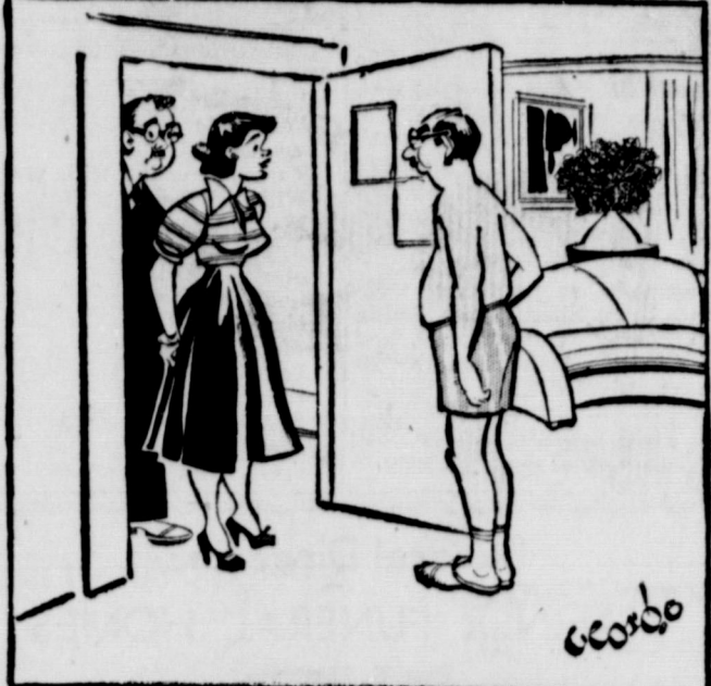
"With six kids in the house, you expect me to be ready?"