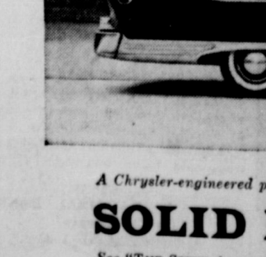
A Chrysler-engineered product, built a new solid way to give you solid satisfaction. SOLID PLYMOUTH 1960 See "THE STEVE ALLEN PLYMOUTH SHOW," Monday nights, NBC-TV. Solid!

YOU'LL ENJOY taking the PROVE-IT-YOURSELF ECONOMY DRIVE... because you see the savings! And, all of the time, you'll enjoy unusual ease of driving and handling.