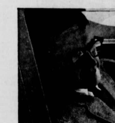
CLOSE-UP OF ECONOMY! Here's the PLYMOUTH PROVE-IT-YOURSELF ECONOMY METER in place. And when you take the test drive, note that brilliant performance is built into the Plymouth engines—including the new design 30-D Economy Six and the famed Plymouth Fury V-800.

At your dealer's now! YOU take the wheel! YOU do the driving! YOU prove how the Solid Plymouth gives more miles per gallon!