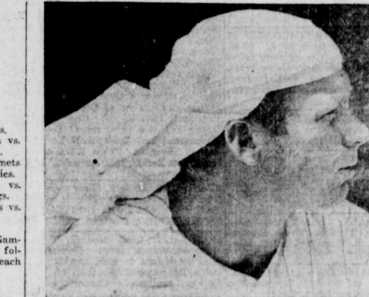
MANTLE OF ARABIA—Like an Arab shiek surveying the desert, Mickey Mantle beats the heat during New York Yankees baseball practice before first game of the season.

Eastland Little League play will get underway here Monday, May 8. The schedule of games has been released. Four teams, the Bulldogs, Lions, Comets and Medics will compete this year.