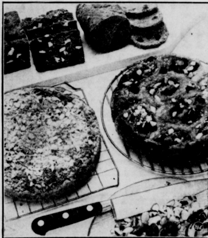
CHOPPED Brazil nuts for coffee cake and cinnamon roll toppings, are Brazil nuts as a flavor ingredient with fruit in a steamed loaf, sprouting enjoyment. See hot bread recipes elsewhere on this page.