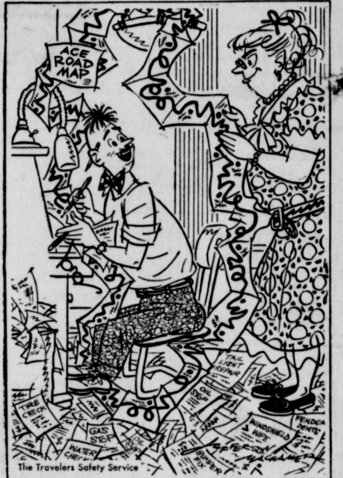
"There! A 1400 mile weekend trip planned to the split second."