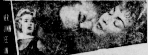
Portrait in Black A ROSS HUNTER PRODUCTION RICHARD BASEHART DIRECTED BY MICHAEL CURTIZ

Opens 6:45 Show Starts 7:15 Admission 50c - Children Under 12 Free Wednesday Is Bargain Night - Adults 25c MONDAY - TUESDAY, MARCH 5, 6, 7