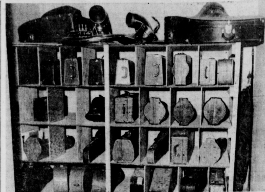
INSTRUMENT STORAGE —One of the features of the new band hall is space. At last the band has space enough to practice and space enough to properly store instruments. This instrument storage rack doesn't appear too glamorous, but it is one of the most functional things in the new building. (Canaris Studio Photo).

Counselor for the group is Miss Edna Striepe.