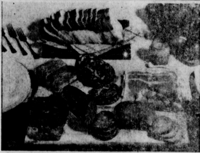
For casual living, bring on a large tray of ready-to-serve meats and let the guests or family help themselves. Meats included on this tray are canned luncheon loaf, salami, "boiled" ham, bologna, tongue and liver sausage. Remember to include the relishes, mustard, pickles, etc.