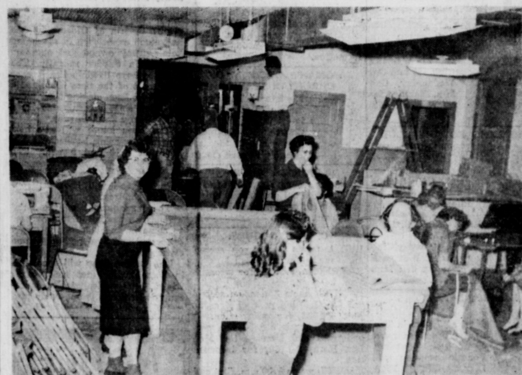
WORK WORK WORK—Members of the Eastland Band Boosters Club are shown during the middle of work done on the new band hall.

Abilene has pushed hard enough. It is time for us to start pushing back.