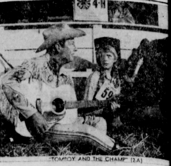
TOMBOY AND THE CHAMP (2-A)

ATTEND THE CHURCH OF YOUR CHOICE EACH SUNDAY